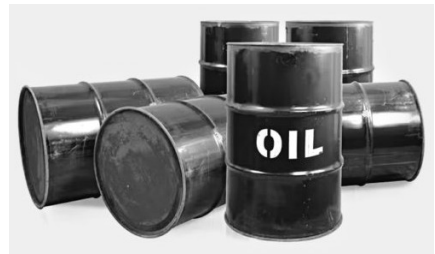
मई में तेल एवं गैस क्षेत्र में रायल्टी की दरें बढ़ने जाने के बाद केंद्र सरकार ने कुछ फायदों को आंशिक रूप से वापस ले लिया था

इस बीच, हाइड्रोकार्बन अन्वेषण और लाइसेंसिंग नीति (एनएएलसी) के तहत बनाई गई नई कैटेगरी के फोर्डर आभी भी है। इनके लिए