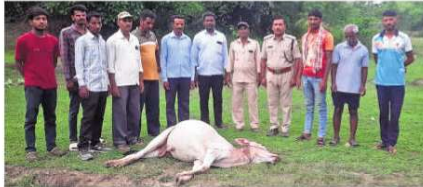
Forest Department officials with villagers and carcass of the bullock

PANIC has gripped farmers in Ghose village of Khanapur onk after leopard attacked and killed a bullock grazing in a farm near the forest on Friday evening.