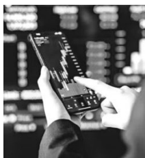
ग्लोबल इमर्जिंग मार्केट (जीईएम) फंडों से लगातार छह हफ्तों में 10 अरब डॉलर की निकाली गई है।

कमोडिटी इंडिक्सी फंडों और बीमागत मुद्दों आदि फंडों से भी बड़ी मात्रा में पैसा वापस निकला है। इलारा ने कहा, 'कुछ मिलाकर, वे इलारा वित्त के लिए एआई इन्फ्रास्ट्रक्चर और कमोडिटी इंडोसिस्टम में बड़े पैमाने पर टॉप-डाउन निवेश