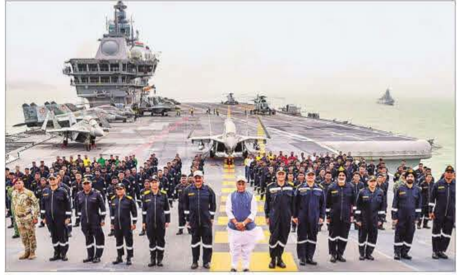
Union defence minister Rajnath Singh, chief of the naval staff, Admiral Dinesh K Tripathi, and others during an interaction aboard aircraft carrier INS Vikrant off the Goa coast on Friday

"Despite remaining silent, the Indian Navy succeeded in tying down the Pakistan Army. This time, Pakistan did not