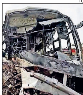
The charred remains of the bus in Dausa Wednesday

"There were 36 passengers in the bus. Eight died and 28 were injured. Twelve injured passengers are undergoing treatment at Dausa district hospital, while 16 were discharged after primary treatment," an