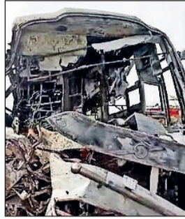
The charred remains of the bus in Dausa Wednesday

Authorities said six bodies were charred beyond recognition and visual identification was not possible. DNA profiling has been initiated to establish their identities