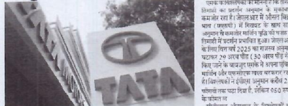
नई दिल्लीको ने सर रोकर के लिए अपने कीमत लक्ष्य और चिंटिंग में संशोधन किया है

टाटा मोटर्स का शेयर बुधवार को बीएस 300 इंडेक्स में 9.06 फीसदी गिरकर 684.25 रुपये के 52 सप्ताह के नए निचले स्तर पर खड़ा था। विल वर 2025 को गोकार तिमाही में निराशाजनक नतीजों के बाद कंपनी के शेयर में बिकाराट आइं शेयर अडिक्टर में 7.37 फीसदी गिरकर 697 पर बढ़ हुआ और शेयर पर सबसे ज्यादा विश्वास करने वाले शामिल रहा। शेयरों का रॉयस 0.30 फीसदी बढ़कर 76,759.81 पर बढ़ हुआ। विल वर 2025 की गोकार तिमाही में कंपनी का शुद्ध लाभ वाला अंश पर 22.4 फीसदी बढ़कर 5,451 करोड़ रुपये का विल वर 2024 को गोकार तिमाही में 7,025 करोड़ रुपये था। नतीजतन शेयर बाजार पर 2.7 फीसदी बढ़कर 1.35,575 करोड़ रुपये का विल वर 2024 में 1,10,577 करोड़ रुपये का था।