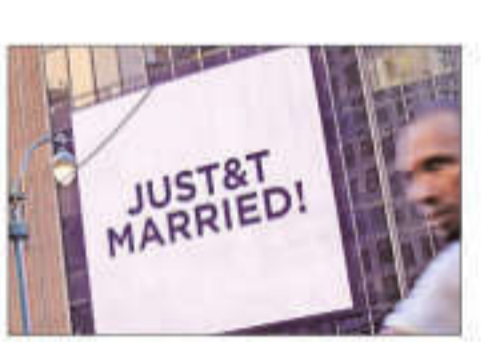
'Just Married' sign displayed on Madison Square Garden

The wedding between the superstar singer and football player took place as fans and