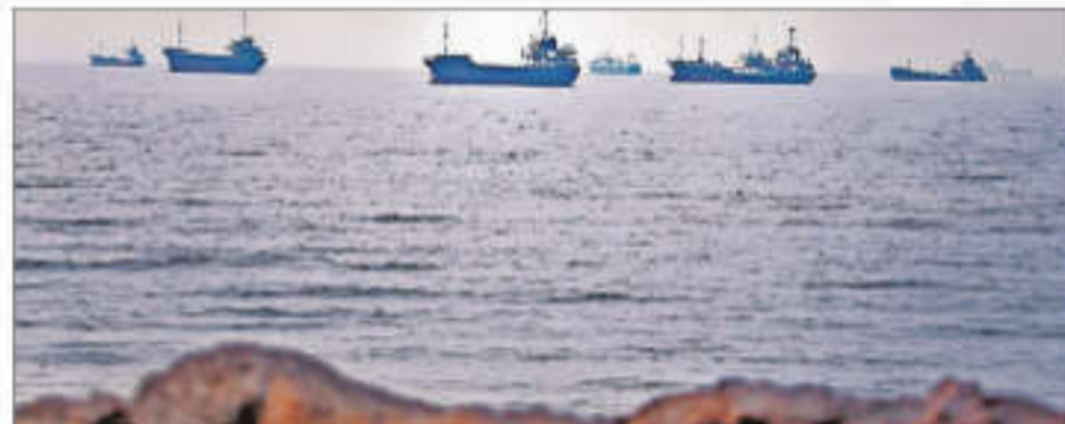
Vessels are seen in the Strait of Hormuz off Bandar Abbas, Iran

AT LEAST EIGHT ships attempting to leave the Persian Gulf along the Omani coast turned back between Friday and Saturday, in the latest sign that reopening the Strait of Hormuz remains complicated by Iran seeking to assert its control over the key waterway.