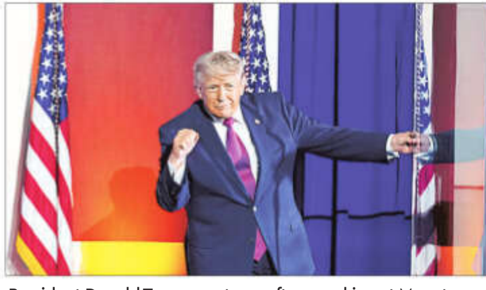
President Donald Trump gestures after speaking at Mount Rushmore National Memorial on Friday evening

He used the milestone of the nation's 250th year to pivot toward a vision of the future, framing this as the beginning of a "golden age of America."