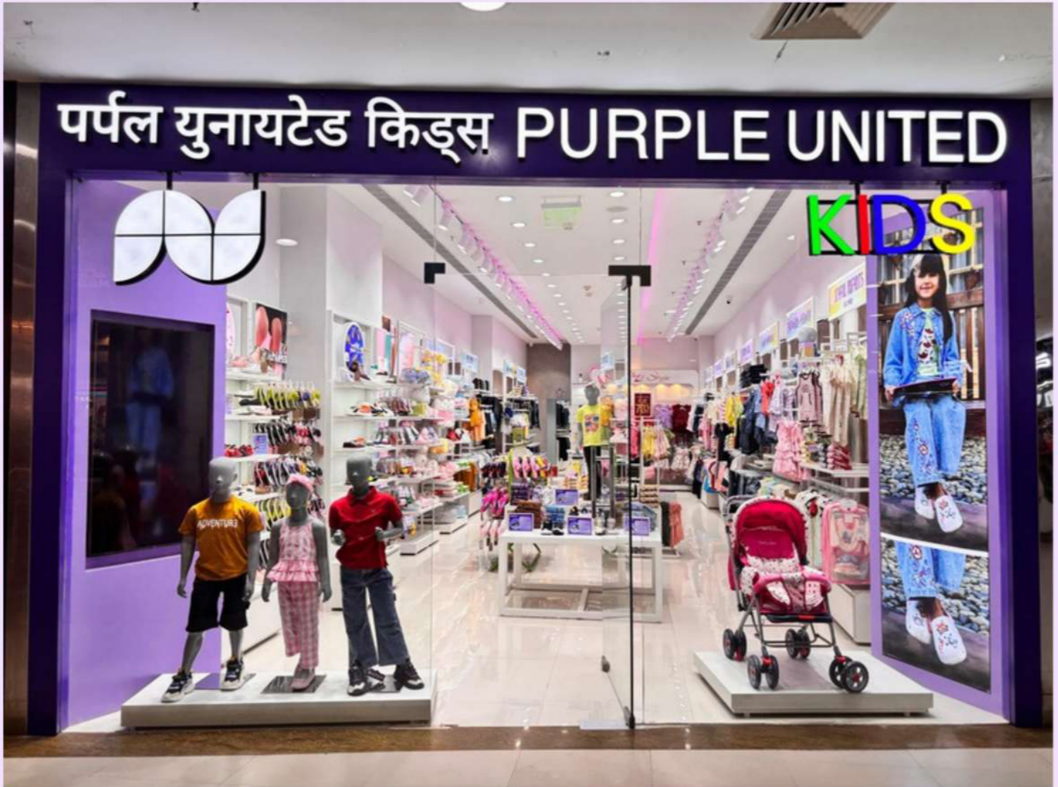
Seasons Mall, Pune