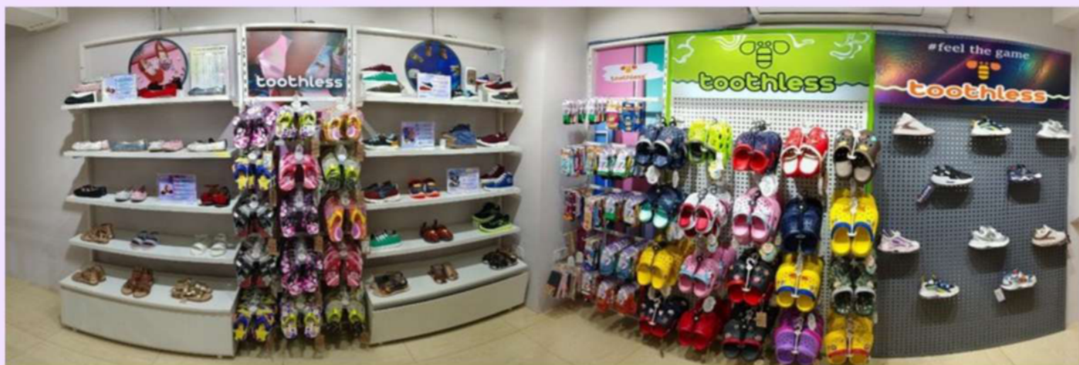
Naharlagun, Arunachal Pradesh