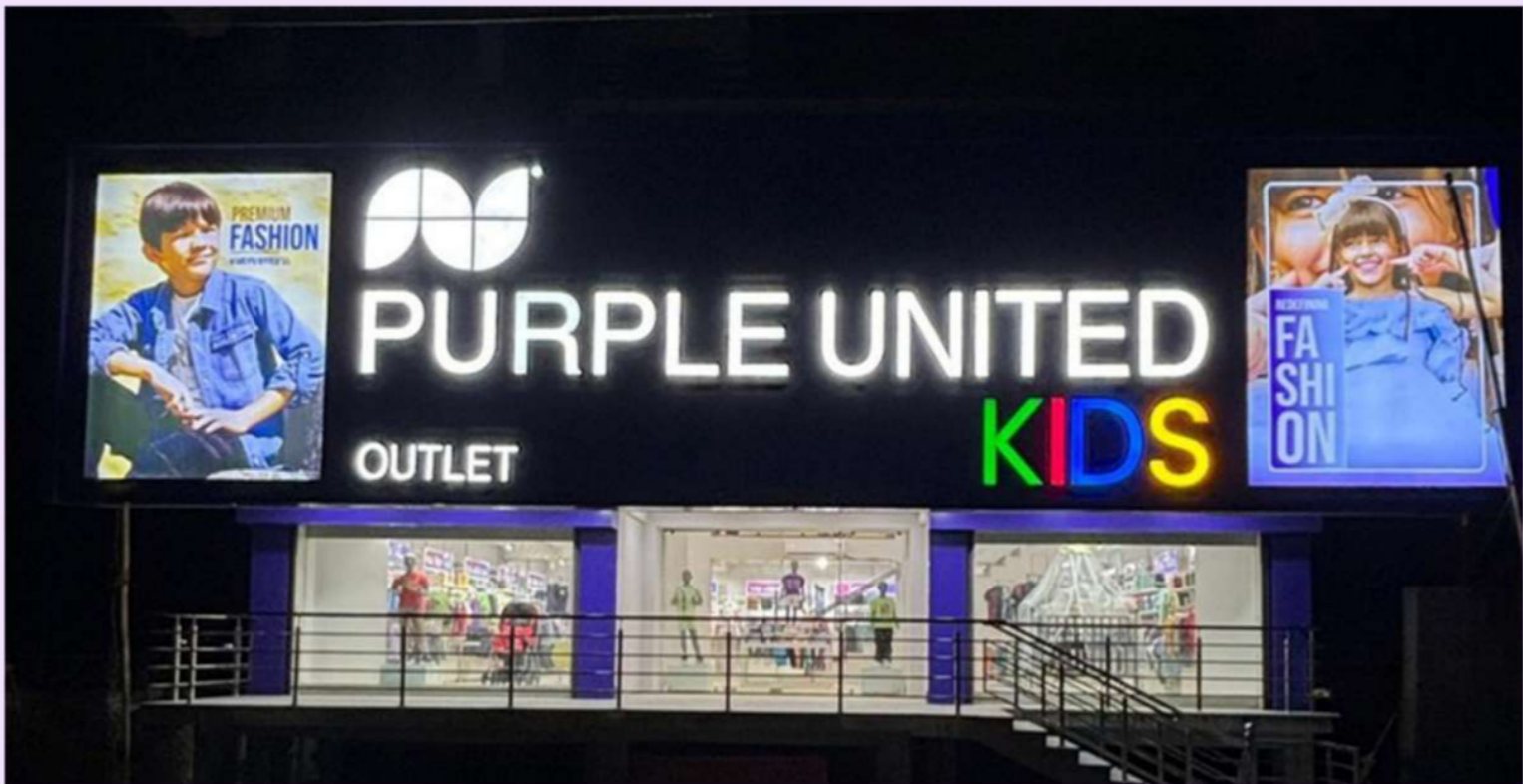
Naharlagun, Arunachal Pradesh