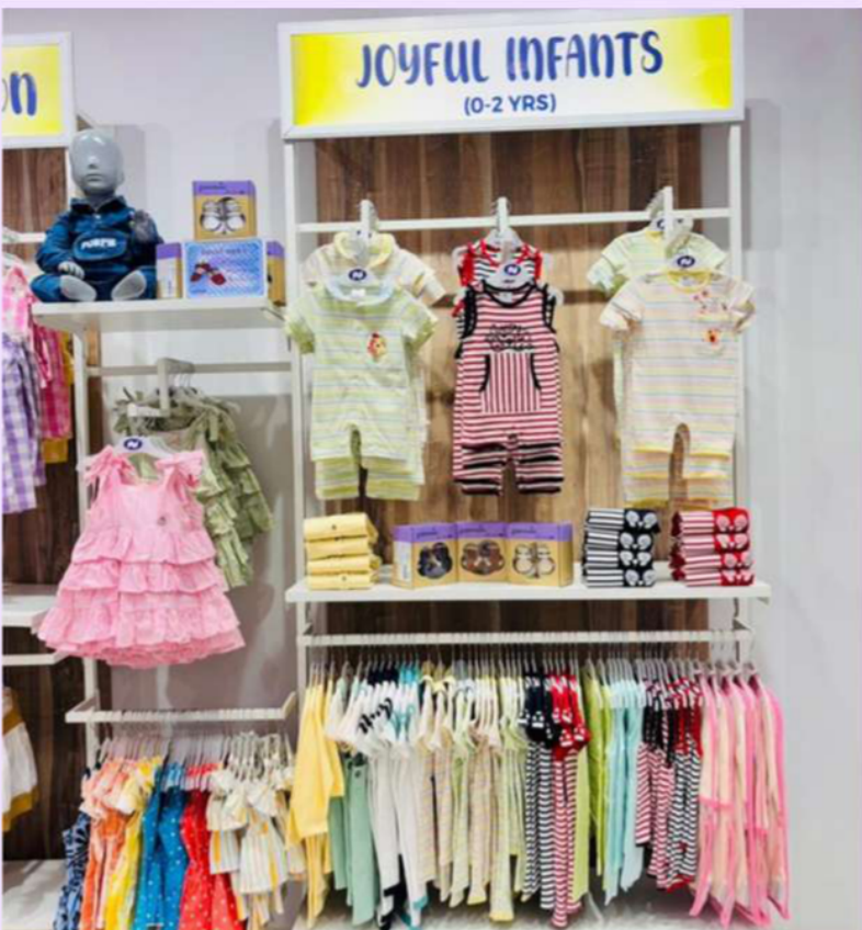
Seasons Mall, Pune