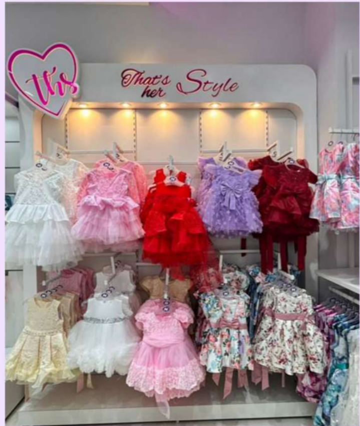
Seasons Mall, Pune