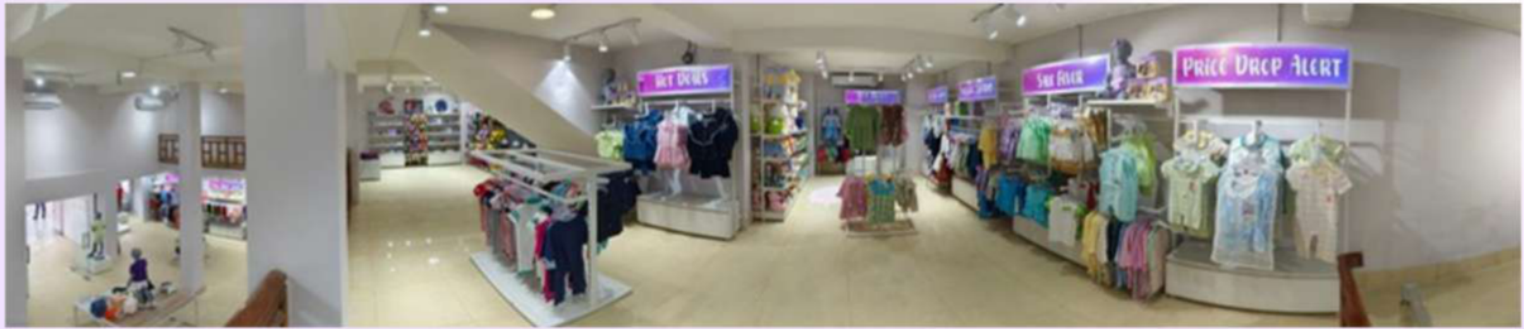
Naharlagun, Arunachal Pradesh