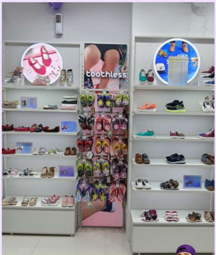
Seasons Mall, Pune