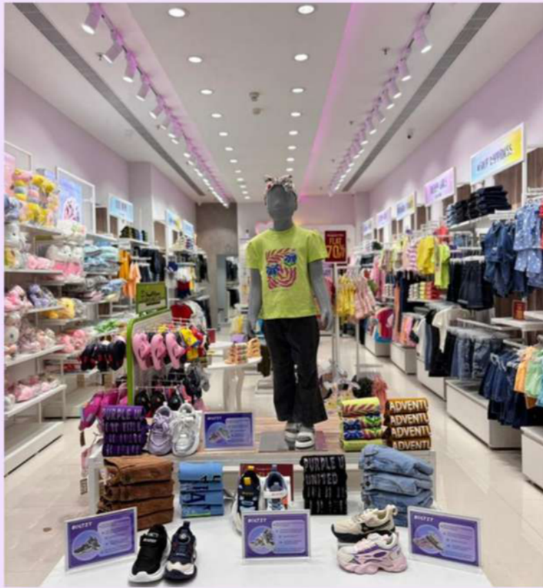
Seasons Mall, Pune