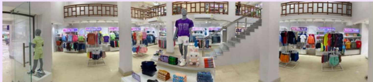
Naharlagun, Arunachal Pradesh