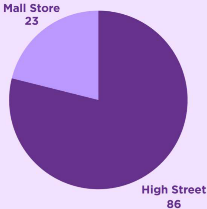
Distribution Of EBO Market Categories