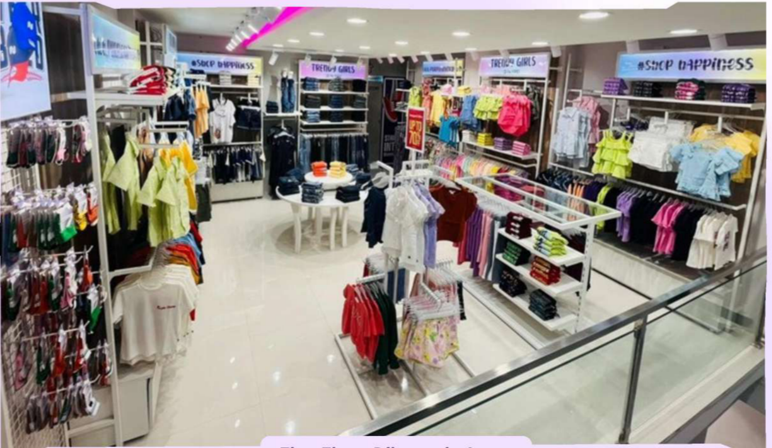
First Floor, Dibrugarh, Assam