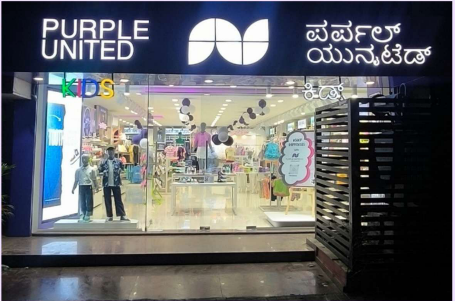
HSR Layout, Bangalore