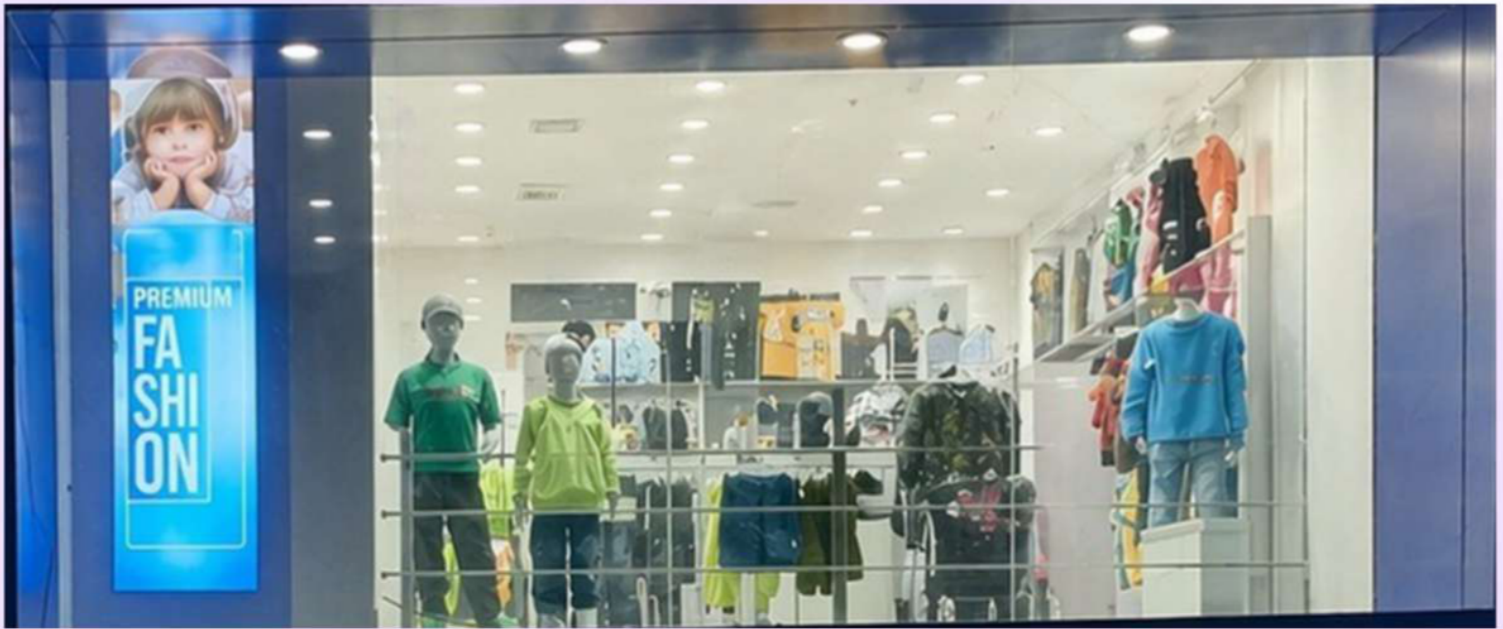
First Floor, Cuttack, Odisha