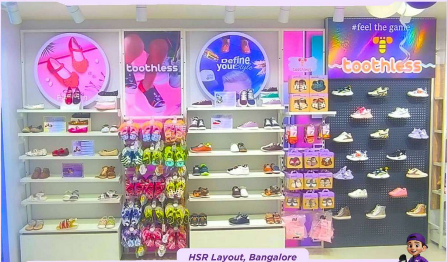
HSR Layout, Bangalore