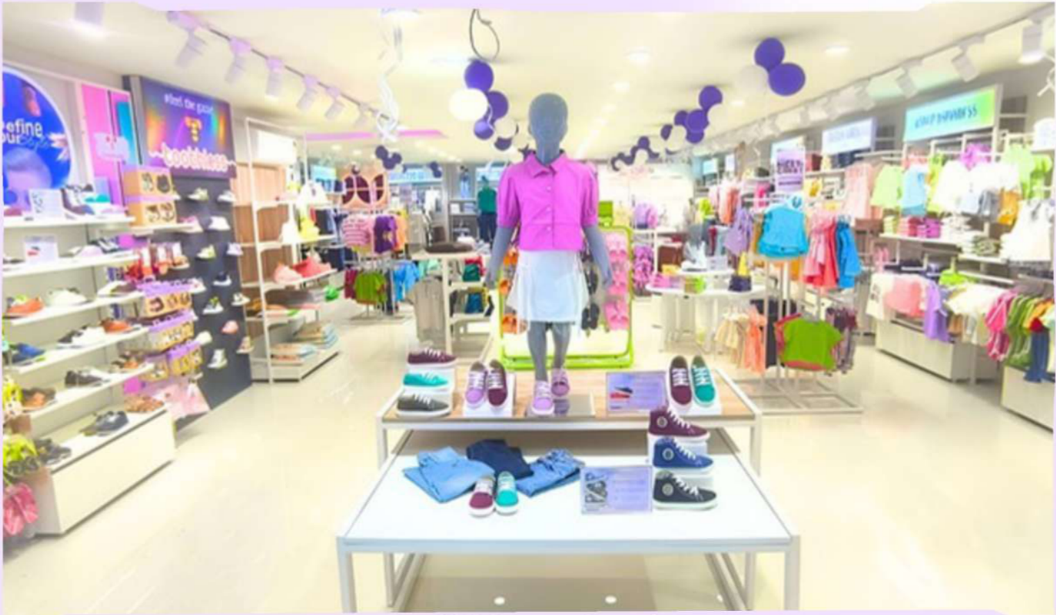
HSR Layout, Bangalore