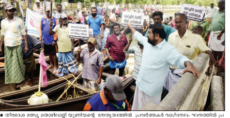
കോമംഗലം : അധ്യക്ഷൻ കമ്മിറ്റി. കോമംഗലം : അധ്യക്ഷൻ കമ്മിറ്റി.