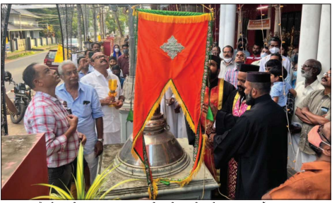
കണ്ടനാട് മതത്തീരം. ത്രൈമാസം സുറിയാനി കത്തോലിക്കാ മതം അതിൽ നടത്തുന്ന ഹോമാജാക്കിങ്ങ് വാങ്ങി പെരുന്നാളിൽ വിമാടി ഹോ. മെമ്മേ കുറിയന്മാർക്കായി കഴിഞ്ഞു.