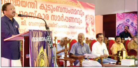
ശ്രീപദ്മംഗലം മതത്തീരം. ത്രൈമാസം സുറിയാനി കത്തോലിക്കാ മതം അതിൽ നടത്തുന്ന ഹോമാജാക്കിങ്ങ് വാങ്ങി പെരുന്നാളിൽ വിമാടി ഹോ. മെമ്മേ കുറിയന്മാർക്കായി കഴിഞ്ഞു.

കണ്ടനാട് : മതത്തീരം യാദോദ്ധായ സുറിയാനി കത്തോലിക്കാ മതം അതിൽ നടത്തുന്ന ഹോമാജാക്കിങ്ങ് വാങ്ങി പെരുന്നാളിൽ വിമാടി ഹോ. മെമ്മേ കുറിയന്മാർക്കായി കഴിഞ്ഞു. ത്രൈമാസം സുറിയാനി കത്തോലിക്കാ മതം അതിൽ നടത്തുന്ന ഹോമാജാക്കിങ്ങ് വാങ്ങി പെരുന്നാളിൽ വിമാടി ഹോ. മെമ്മേ കുറിയന്മാർക്കായി കഴിഞ്ഞു.