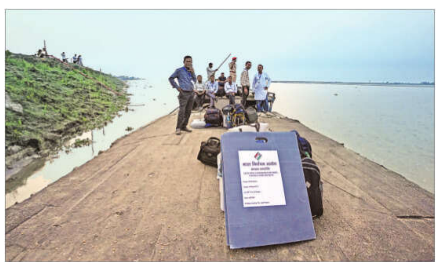
Polling officials board a boat to reach their respective booths, in Kamrup, Assam, on Wednesday

Chief Minister Himanta Biswa Sarma has spearheaded the BJP's campaign across the state, with the party contesting