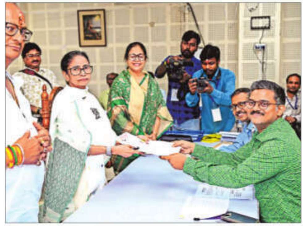
West Bengal Chief Minister and TMC candidate from the Bhabanipur constituency, Mamata Banerjee, files her nomination on Wednesday

Her Wednesday remarks at rallies in Hooghly district's Arambagh, Balagarh and Sreerampore came a day after Election Commission data showed nearly 9.1 million voters have been deleted from the electoral rolls in West Bengal from the original voter base of 76.6 million in October 2025 following the SIR exercise. "You will not be able to defeat the TMC by deleting