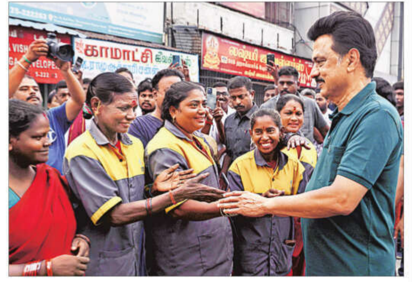
Tamil Nadu Chief Minister and DMK candidate from Kolathur constituency, MK Stalin, interacts with women workers during a voter outreach, in Tiruvannamalai on Wednesday

THE ELECTION COMMISSION on Wednesday recalled its general observer from a West Bengal constituency for not having basic information about the seat where he was deployed. Officials said during a briefing of the observers by the EC, it was found that Anurag Yadav, general observer, Cooch Behar Dakshin, did not know the number of polling stations in his Assembly constituency. He was immediately recalled by the order of the commission. West Bengal goes for polls in two phases on April 23 and 29. The poll panel deploys general, expenditure and police observers in poll-bound states to work as its eyes and ears. They report to the poll authority about different aspects from the ground to help it take corrective steps. —PTI