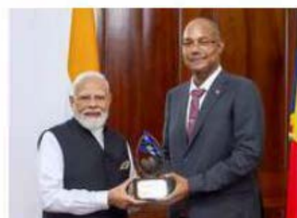
PM Modi being awarded the 'Guardian of the Blue Horizon' by Seychelles President Patrick Herminie in Victoria, AUH

Press Trust of India Victoria (Seychelles)