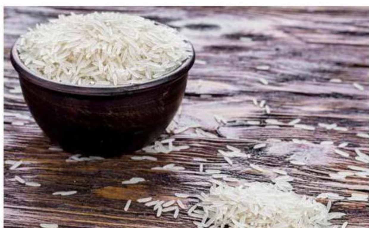
GROWING NUMBERS. India exported 6.52 million tonnes of the aromatic grain in 2025-26, up from 6.07 mt a year earlier

However, the current tensions between Afghanistan and Pakistan have prompted Kabul to explore alternative supply channels, including direct import from India, according to industry sources.