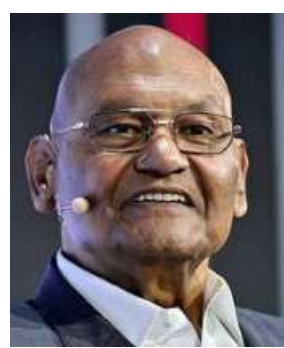
Anil Agarwal, Chairman, Vedanta Group

'NEED MORE VEDANTAS' Post demerger, the parent company Vedanta will consist of Hindustan Zinc, Zinc International, the copper business at Thoothukudi,