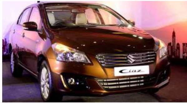
FACING SUNSET. Drop in sales over the last few years and competition from new comers among reasons for the phase out

With Maruti Suzuki's mid-size sedan 'Ciaz' likely to be discontinued, according to sources, the total sales of the already declining segment will dwindle further.