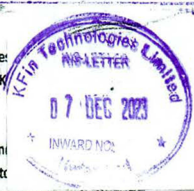
ABB SHOS SHOG