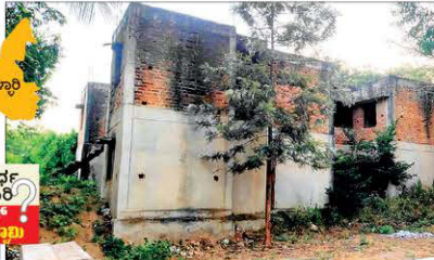
ಅಧ್ಯಯನ ಮಾಡಿದ ಕಾಲೇಜಿನ ವಿದ್ಯಾರ್ಥಿಗಳಿಗೆ ಅನುದಾನದ ಕೊರತೆಯಿಂದಾಗಿ ವಸತಿ ಗೃಹ ನಿರ್ಮಾಣ ಸ್ಥಗಿತವಾಗಿದೆ.

ಸೋಲಂಬದ ಅನುದಾನದೊಂದಿಗೆ ಅನುದಾನ ದೊರಕದುದರಿಂದ ಗಣಿ ಚಿಲ್ಲರೂ ವಸತಿ ಅಭಿವೃದ್ಧಿ ಕಾಮಗಾರಿಯು, ಕಳೆದ ಹದಿನಾರು ದಿನಗಳಿಂದ ಸ್ಥಗಿತವಾಗಿದೆ. ಇದರ ಬಗ್ಗೆ ಅಧ್ಯಯನ ಮಾಡಿದ ಕಾಲೇಜಿನ ವಿದ್ಯಾರ್ಥಿಗಳಿಗೆ ಅನುದಾನದ ಕೊರತೆಯಿಂದಾಗಿ ವಸತಿ ಗೃಹ ನಿರ್ಮಾಣ ಸ್ಥಗಿತವಾಗಿದೆ. ಇದರ ಬಗ್ಗೆ ಅಧ್ಯಯನ ಮಾಡಿದ ಕಾಲೇಜಿನ ವಿದ್ಯಾರ್ಥಿಗಳಿಗೆ ಅನುದಾನದ ಕೊರತೆಯಿಂದಾಗಿ ವಸತಿ ಗೃಹ ನಿರ್ಮಾಣ ಸ್ಥಗಿತವಾಗಿದೆ.