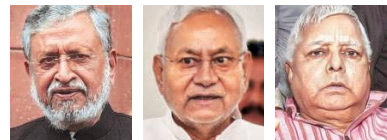
The Sampooran Kranti movement led to the emergence of Bihar's biggest leaders, including Sushil Kumar Modi, Nitish Kumar and Lalu Prasad, giving wings to the political aspirations of students in the state

Struggling with migration, funding crunch and lack of recognition, Bihar's student wings are now trying for representation at the national level.