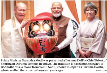
Prime Minister Narendra Modi was presented a Daruma Doll by Chief Priest of Shorinzan Daruma Temple, in Tokyo. The tradition is based on the legend of Bodhidharma, a monk from Tamil Nadu, known in Japan as Daruma Daisai, who travelled there over a thousand years ago

It has also envisaged collaboration between special operations units, utilising each other's facilities for repair and maintenance of defence platforms and promoting naval and coast guard cooperation for