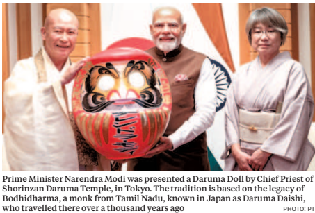
Prime Minister Narendra Modi was presented a Daruma Doll by Chief Priest of Shorinzan Daruma Temple, in Tokyo. The tradition is based on the legend of Bodhidharma, a monk from Tamil Nadu, known in Japan as Daruma Daisai, who travelled there over a thousand years ago

It has also envisaged collaboration between special operations units, utilising each other's facilities for repair and maintenance of defence platforms and promoting naval and coast guard cooperation for