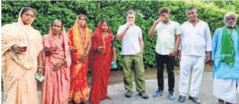
A group of seven voters from Bihar met the Leader of Opposition in Lok Sabha at his residence and shared their experience of how they were declared "dead" by the EC.

In the video of the meeting shared by the Congress, a person is seen telling Gandhi that most of these voters were from Raghupur Assembly segment, which is represented by former Bihar chief minister and Rashtriya Janata Dal leader Tejashwi Yadav. During the interaction, which