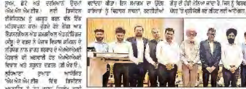
ਸੀਸੂ ਨੇ ਸੈਸ਼ਨ ਕਰਵਾਇਆ... ਪੰਜਾਬ ਵਿਕਾਸ ਕਮਿਸ਼ਨ ਦੇ ਸਹਿਯੋਗ ਨਾਲ ਸੀਸੂ ਨੇ ਸੈਸ਼ਨ ਕਰਵਾਇਆ...