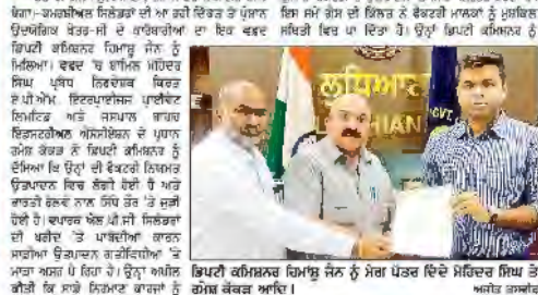
ਦੁੱਢਰਗੱਡੀ ਤੇ ਵਪਾਰਕ ਅਦਾਰੇ ਕਰਮਗੀਅਰ ਗੈਸ ਸਿਲੰਡਰਾਂ ਦੀ ਕਿੱਲਤ ਤੋਂ ਪ੍ਰੇਸ਼ਾਨ... ਦੁੱਢਰਗੱਡੀ ਤੇ ਵਪਾਰਕ ਅਦਾਰੇ ਕਰਮਗੀਅਰ ਗੈਸ ਸਿਲੰਡਰਾਂ ਦੀ ਕਿੱਲਤ ਤੋਂ ਪ੍ਰੇਸ਼ਾਨ...