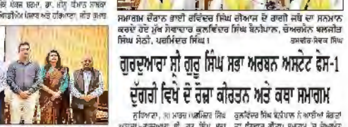
ਗੁਰਦੁਆਰਾ ਸ੍ਰੀ ਗੁਰੂ ਸਿੰਘ ਸਭਾ ਅਰਬਨ ਅਸਟੇਟ ਫੇਜ਼-1 ਦੁੱਗਰੀ ਵਿਖੇ ਦੋ ਰੋਜ਼ਾ ਕੀਰਤਨ ਅਤੇ ਕਥਾ ਸਮਾਗਮ... ਗੁਰਦੁਆਰਾ ਸ੍ਰੀ ਗੁਰੂ ਸਿੰਘ ਸਭਾ ਅਰਬਨ ਅਸਟੇਟ ਫੇਜ਼-1 ਦੁੱਗਰੀ ਵਿਖੇ ਦੋ ਰੋਜ਼ਾ ਕੀਰਤਨ ਅਤੇ ਕਥਾ ਸਮਾਗਮ...