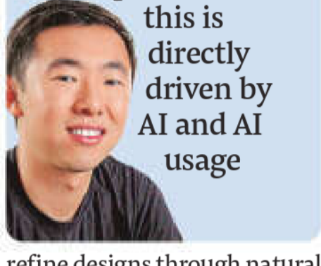
refine designs through natural language inputs.

We saw over 40% growth in revenue which honestly shocked me. And very significant portion of this is directly driven by AI and AI usage refine designs through natural language inputs. "India is our second-biggest market in terms of AI usage," Wu said, adding that the country is also among its fastest-growing markets and ranks fourth overall. He said