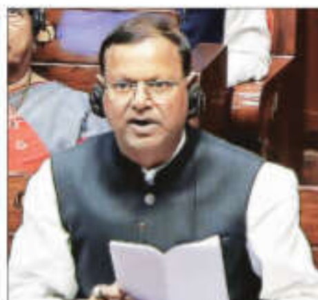
Union Minister of State for Finance Pankaj Chaudhary

As per the new public sector enterprise (PSE) policy issued by