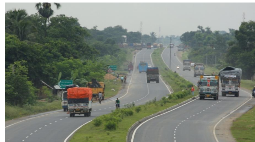
Km 341 (Farakka Raiganj Highway)