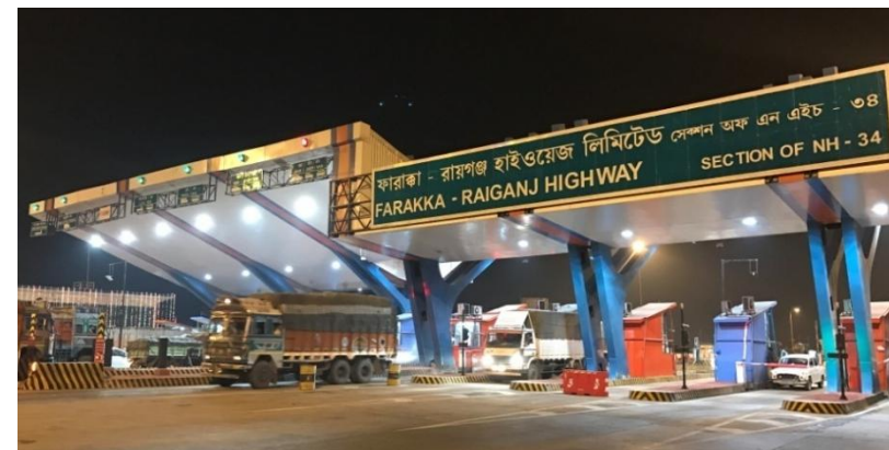
Farakka Raiganj Highway: Toll Plaza at Km 297