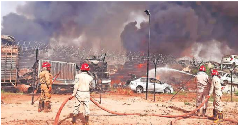
Fire personnel fight the blaze at police Malkhana on Thursday.

"Sometimes, it takes us 15 minutes to only get out of the Barakhamba area," he says. "Apart from traffic congestion, narrow lanes are another obsta-