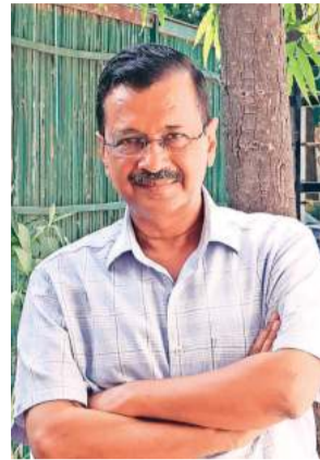
Arvind Kejriwal is currently out on bail till June 1.

Other AAP leaders arrested in the same case include former Deputy Chief Minister of Delhi, Manish Sisodia and Member of Parliament Sanjay Singh. While Sisodia is still in judicial custody, Singh is out on bail.