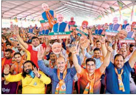
NDA supporters at PM Narendra Modi's public meeting for the last phase of Lok Sabha elections, in Hoshiarpur, Punjab, on Thursday

Hitting back at the Congress for its charge that the BJP would scrap the Constitution if voted to power, Modi said,