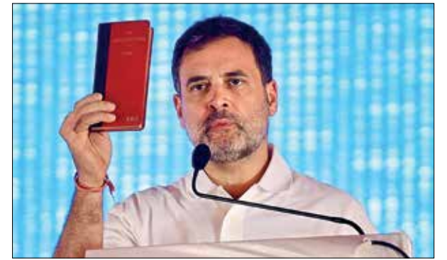
Congress leader Rahul Gandhi during a public meeting for Lok Sabha elections, in Khatkar Kalan village near Jalandhar, on Thursday

to divide the country on the basis of religion," he alleged as he slammed the INDIA alliance.