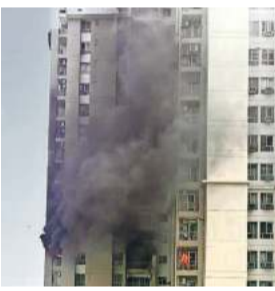
The blaze took place in Lotus Boulevard, Sector 100

tion sent five fire-fighting vehicles to the spot. The CFO said that following the blast, a table in the room caught fire that soon spread to the room. The blaze did not spread to the rest of the flat as the fire-fighting system worked well, Kumar said.