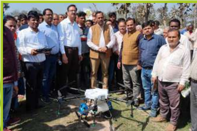
Demonstration of Drone at a Farm by NFL officials