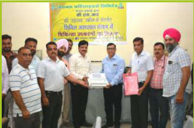
Medical equipments distributed to Civil Hospital, Nangal under CSR