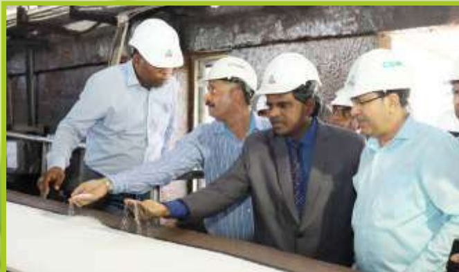
C&MD inspecting Urea prills at Urea Convyer Belt in Panipat Plant