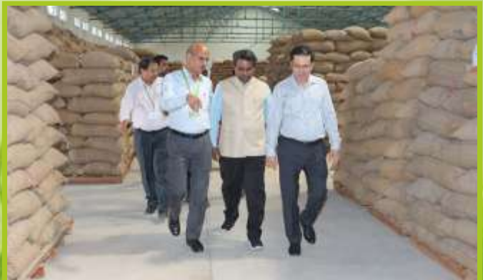
Chairman & Managing Director at Seed Processing Plant in Panipat