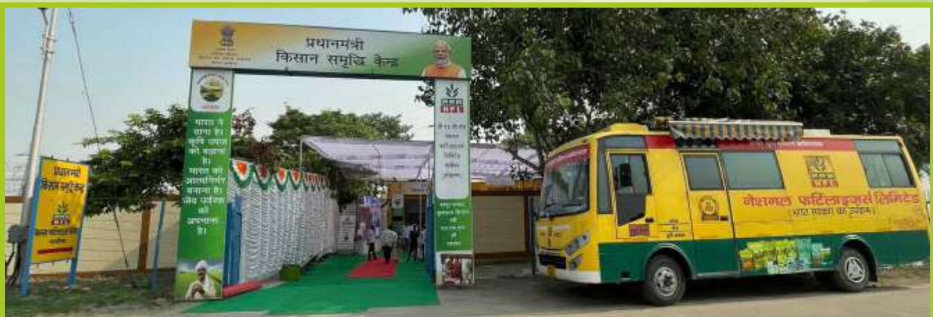
A view of NFL PMKSK at Panipat with Soil Testing Van