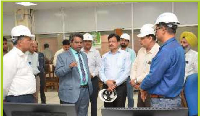
Chairman & Managing Director in GTG control room at Nangal Plant