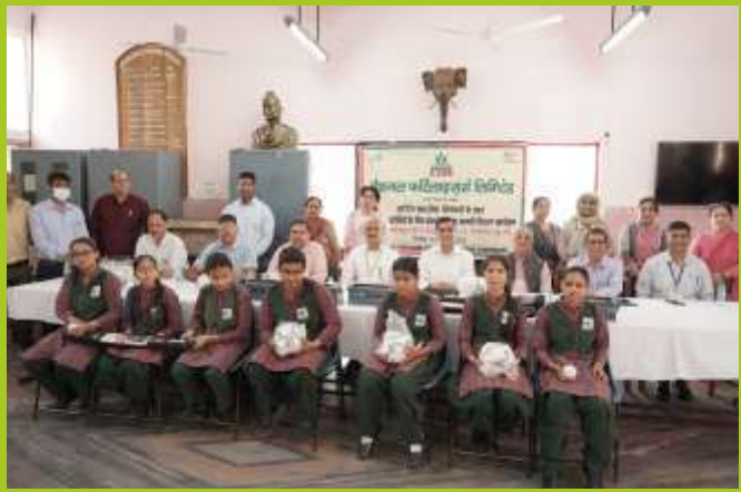
Sports items and brailers distributed to Institute for the Blind in Chandigarh