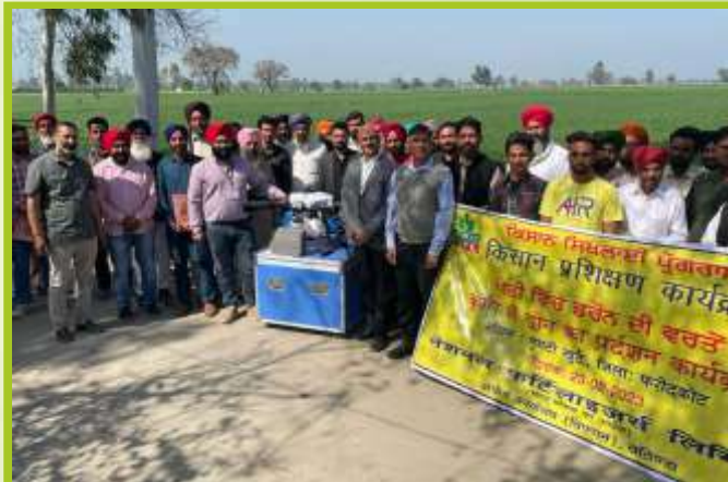
Demonstration of Drone at a Farm by NFL officials