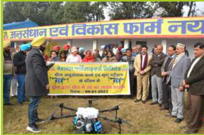
Demonstration of Drone at R&D Farm in Nangal Unit