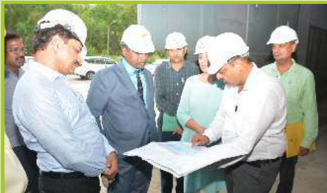
C&MD getting information on the setup plan of Nano Urea Plant