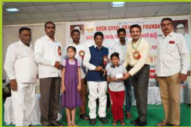
Distribution of Digital Hearing Aids to the underprivileged beneficiaries at a distribution camp organised in Kakinada, Andhra Pradesh