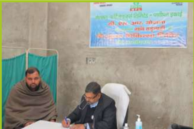
A view of free medical checkup camp organized in a village near Panipat