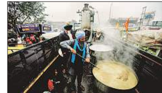
The 15-foot-tall steam boiler at Singhu border. Praveen Khanna