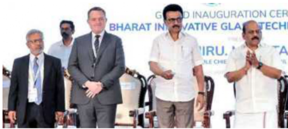
GLASS HUB. Tamil Nadu Chief Minister MK Stalin inaugurating Corning's pre-cover glass facility in Kancheepuram

Tamil Nadu Chief Minister MK Stalin inaugurated a pre-cover glass manufacturing facility set up by Bharat Innovative Glass Technologies Private Ltd, a joint venture between US-based Corning International Corporation and Indian telecom major Optimus Infracom, in Kancheepuram district on Friday.