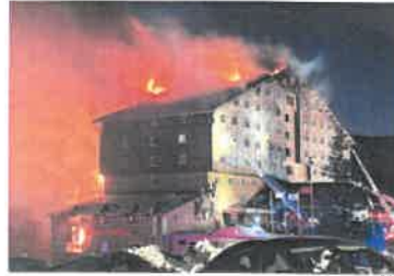
The fire is believed to have started in the Grand Kartal hotel's restaurant section on Tuesday