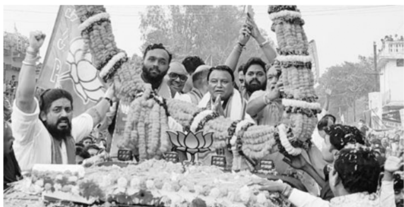
Odisha CM Mohan Charan Majhi (with folded hands) during a recent election campaign at Sunabeda in Komna block of Nuapada district.

Bordering Chhattisgarh, Nuapada faces persistent challenges of migration, water scarcity, and agrarian distress, particularly among paddy farmers. Two other factors likely to influence the bypoll outcome are the tribal population, which accounts for over 33 per cent of the electorate, and women voters, who form 51 per cent of the constituency.