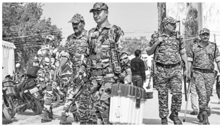
Security officials carry EVMs ahead of the second phase of voting in Bihar Assembly elections, in Gaya on Monday.

At a press conference in Patna, Yadav claimed that the EC provided the gender-wise data earlier after the con-