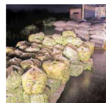
The accused were headed to Rajasthan.