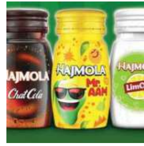
The products are licensed under Ayurvedic and Unani Services under the Drug and Cosmetics Act, 1940

Hajmola, a popular product of Dabur, is back in the news as the Directorate General of GST Intelligence (DGGI) has issued a show-cause notice on its classification—whether it should be treated as normal candy or an ayurvedic preparation.