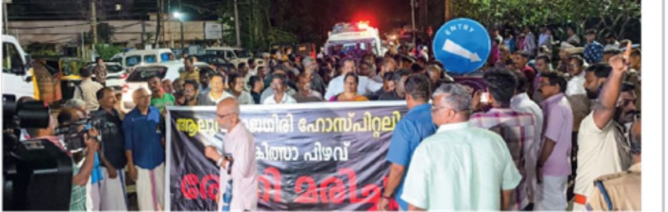
രോഗി മരിച്ചത് ചികിത്സാപരിഷ്കരണത്തിന് ആവേശം സൃഷ്ടിച്ചു

കൊച്ചി ജോലി വാഗ്ദാനം ചെയ്ത് തിട്ടു: പ്രതി പിടിയൽ