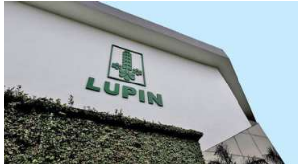
HEALTHY MOVE. Earlier this year, Lupin had said it was transferring its OTC consumer healthcare business to a wholly owned subsidiary for ₹550-650 crore.