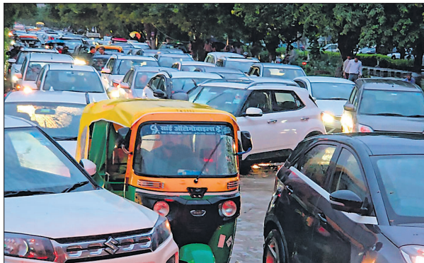
Hundreds were stuck in traffic jams or stranded outside Metro stations without last-mile transport.

Hundreds were stuck in traffic jams or stranded outside Metro stations without last-mile transport.