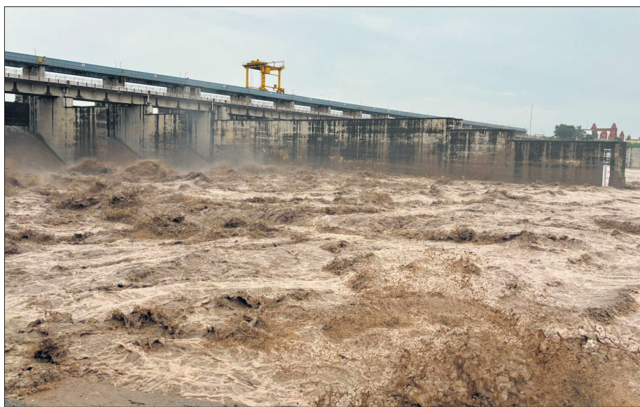
The water flow was recorded at 3.29 lakh cusecs at Hathnikund barrage in Yamunanagar on Monday.