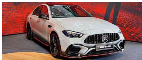
SALES SKID. The carmaker reported a decline of around 13 per cent on year in its Q1 sales to 4,775 units due to lower entry-level car volumes

The company, meanwhile, reported a decline of around 13 per cent year-on-year (y-o-y) in its first quarter sales to 4,775 units (5,412 units) because of lower volume sales in entry-level cars.