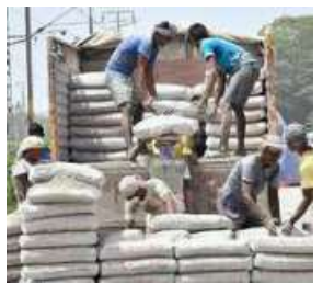
February saw price improvements, with all-India average cement prices increasing by ₹5-15 per bag

Cement makers are banking on improved demand in the January-March period to sustain a price hike of ₹14-16 per bag, pan-India, in April, apart from expecting a 6-7 per cent volume growth.