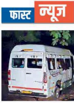
अपघातग्रस्त मिनी बस