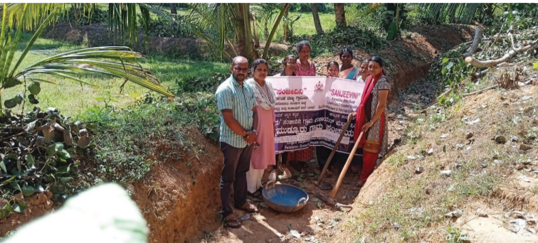
ಇಂಗು ಗುಂಡಿ ರಚಿಸಿದ ಚಿಗುರು ಸಂಜೀವಿನಿ ಒಕ್ಕೂಟದ ಸದಸ್ಯೆಯರು.

• ಕನ್ನಡಪ್ರಭ ವಾರ್ತೆ ಬಂಟ್ವಾಳ ಮಳೆಗಾಲದಲ್ಲಿ ಗುಡ್ಡದಲ್ಲಿ ಹರಿದು ನದಿ ಸೇರುವ ನೀರನ್ನು ಹಿಡಿದುಕೊಂಡು ಭೂಮಿಗೆ ಇಳಿಸಿ ಅಂತರ್ಜಲ ಮಟ್ಟ ಹೆಚ್ಚಿಸಲು ಬಂಟ್ವಾಳ ತಾಲೂಕಿನ ವಿಟ್ಟಮುಡೂರು ಗ್ರಾಮ ಪಂಚಾಯತಿಯ ಚಿಗುರು ಸಂಜೀವಿನಿ ಒಕ್ಕೂಟದ 6 ಮಂದಿ ಮಹಿಳೆಯರು ಸುಮಾರು 200ಕ್ಕೂ ಹೆಚ್ಚು ಇಂಗುಗುಂಡಿಗಳನ್ನು ನಿರ್ಮಿಸುವ ಮೂಲಕ ಮಾದರಿಯಾಗಿದ್ದಾರೆ.