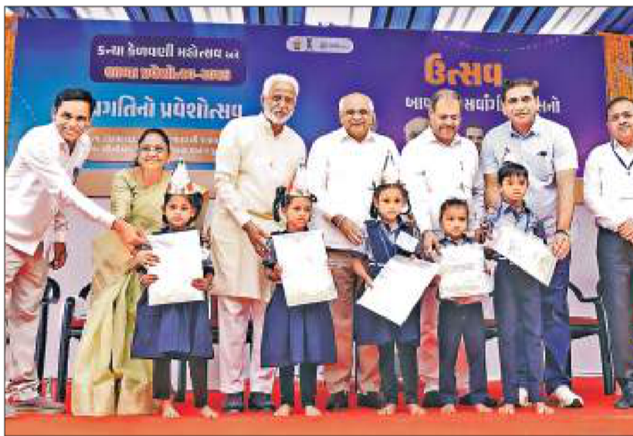
Chief Minister Bhupendra Patel with newly enrolled school children at the launch of the three-day 24th Shala Praveshotsav and Kanya Kelavani at B N High School in Vadnagar, Mehsana, on Tuesday.

The CM recalled how Shala Praveshotsav and Kanya Kelavani, launched by Modi when he was the CM of Gujarat, transformed the state's education sector. "At one time, the school dropout ratio of Gujarat was 37% - meaning out of 100 enrolled students, 37 used to drop out. Today, with this campaign, we are getting two-fold benefits. First, there is 100% enrollment and after that the dropout (ratio) has come down to less than 1%. It is a big success of this