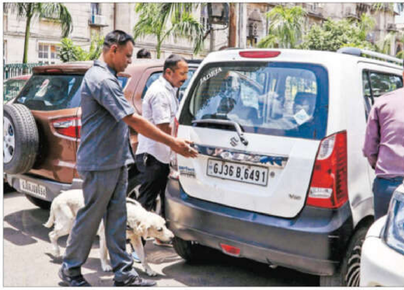
Police search the premises of the Vadodra Municipal Corporation on Wednesday.