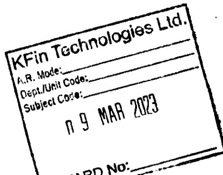
Vanessa Sophia Fernandes