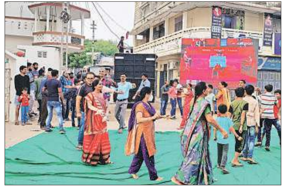
Family members of Paralympics silver medalist Bhavina Patel celebrate her win at Visnagar town of Mehsana district on Sunday.

Looking at the previous year's trends, the months of September, October and November in 2020 reported the highest cases-125, 291 and 226, respectively.