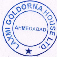
Chairman of the EOGM of the Company