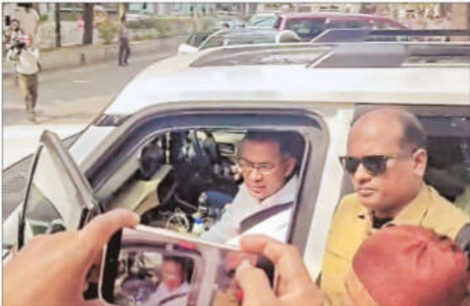
Bangladesh Nationalist Party (BNP) leader Tarique Rahman leaves from his residence to offer prayers at a mosque in Dhaka on Friday after the election results

SIGNALLING THE START of a new chapter in the country’s history, the centre-right Bangladesh Nationalist Party (BNP), led by Tarique Rahman, returned to power Friday after nearly two decades, securing a landslide victory in the first national elections since the August 2024 ouster of Prime Minister Sheikh Hasina. The Election Commission announced that the BNP had won 209 seats in the 300-seat Bangladesh parliament. With a commanding two-thirds majority, the BNP will be able to form the government and 60-year-old Rahman, who is tipped to be the Prime Minister, will not need the support of smaller parties to push his agenda in the Jatiyo Shangsad, the country’s parliament. There was no immediate statement from the BNP but it released photographs of Rah-