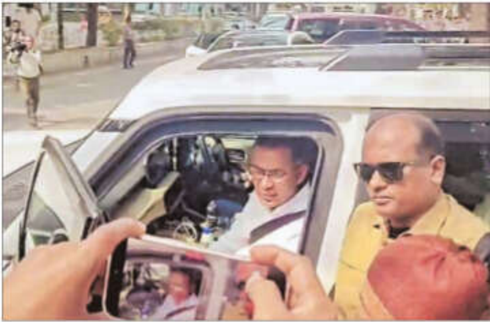
Bangladesh Nationalist Party (BNP) leader Tarique Rahman leaves from his residence to offer prayers at a mosque in Dhaka on Friday after the election results

SIGNALLING THE START of a new chapter in the country’s history, the centre-right Bangladesh Nationalist Party (BNP), led by Tarique Rahman, returned to power Friday after nearly two decades, securing a landslide victory in the first national elections since the August 2024 ouster of Prime Minister Sheikh Hasina. The Election Commission announced that the BNP had won 209 seats in the 300-seat Bangladesh parliament. With a commanding two-thirds majority, the BNP will be able to form the government and 60-year-old Rahman, who is tipped to be the Prime Minister, will not need the support of smaller parties to push his agenda in the Jatiyo Shangsad, the country’s parliament. There was no immediate statement from the BNP but it released photographs of Rah-