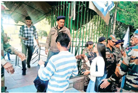
Security personnel keep watch as students enter Jamia Millia Islamia on Wednesday. //1

The university administration, citing disruption to academic activities and damage to university property, said in a statement Thursday morning, "This handful of students have, in the last two days, vandalised university property, including the central canteen, and also broke the gate of the security advisor's office, forcing the JMI administration to