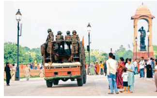
Armed men stand guard at India Gate on Thursday.

Local police and paramilitary personnel have also been deployed at the COG Complex in South Delhi. All Deputy Commissioners of Police have