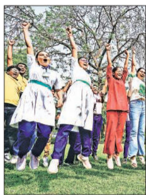
Students in Ahmedabad on Wednesday. (BHUPENDRA RANA)

Districts with highest decline of pass percentage in 3 years