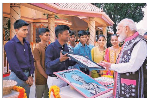
Prime Minister Narendra Modi with students at Dediapada in November 2025. FILE

Forty-one schools in the district achieved 100% results, a 37% increase over last year's number of 30 schools. The pass percentage in no school fell below 30%, Narmada District Education Officer (DEO) Kiran Patel said.