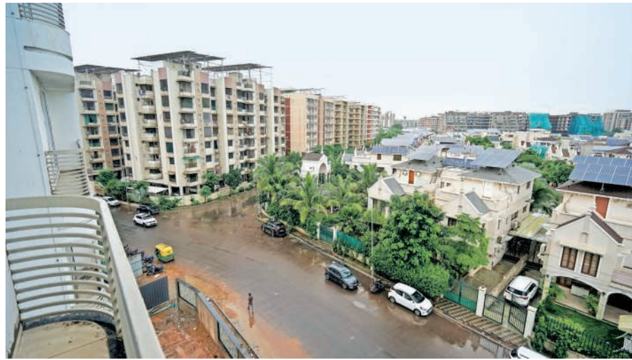
An aerial view of Nikol where Prime Minister Narendra Modi held a road show and public rally dedicating infra projects worth ₹5400 crore on August 25. Bhupendra Rana

ON AUGUST 25, the day that marked 10 years of the largest Patidar quota agitation rally led by Hardik Patel on the GMDC Grounds in Ahmedabad, Prime Minister Narendra Modi was in Nikol, a Patidar-dominated Assembly constituency of Ahmedabad and one of the areas which remained under curfew after violence during the protests in 2015.