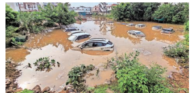
At Himmatnagar, in Sabarkantha district on Saturday.