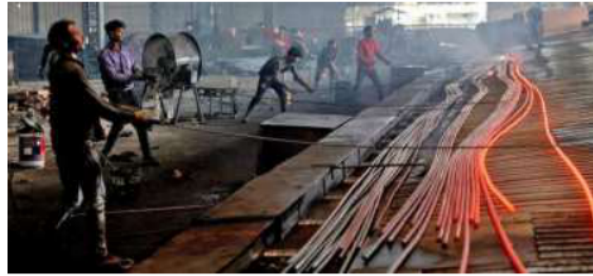
IMPETUS NEEDED. Core sector output crawled to a two-month high of 1.7 per cent in April, buoyed by steel, cement and electricity, despite contractions in five other sectors

“The continued resilience in construction-linked sectors, expanding manufacturing exports, sustained hiring