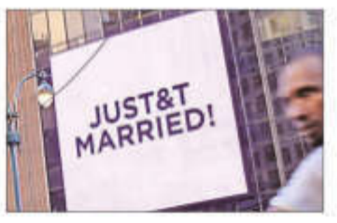
'Just Married' sign displayed on Madison Square Garden

The wedding between the superstar singer and football player took place as fans and