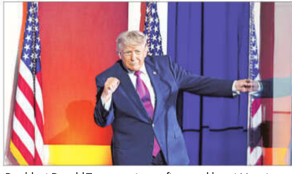
President Donald Trump gestures after speaking at Mount Rushmore National Memorial on Friday evening

He used the milestone of the nation's 250th year to pivot toward a vision of the future, framing this as the beginning of a "golden age of America."