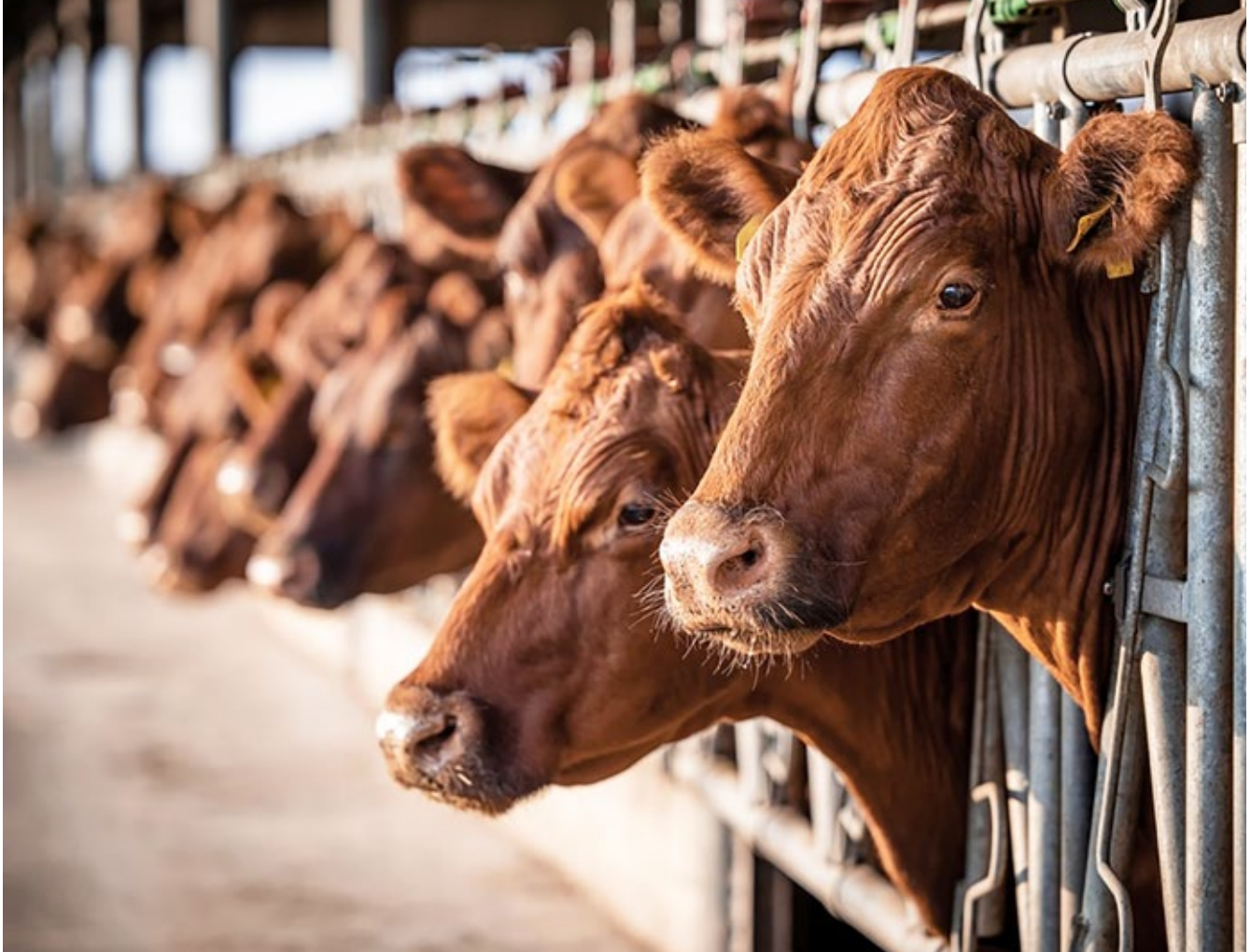
The Company contributed to numerous cow shelters for cattle welfare