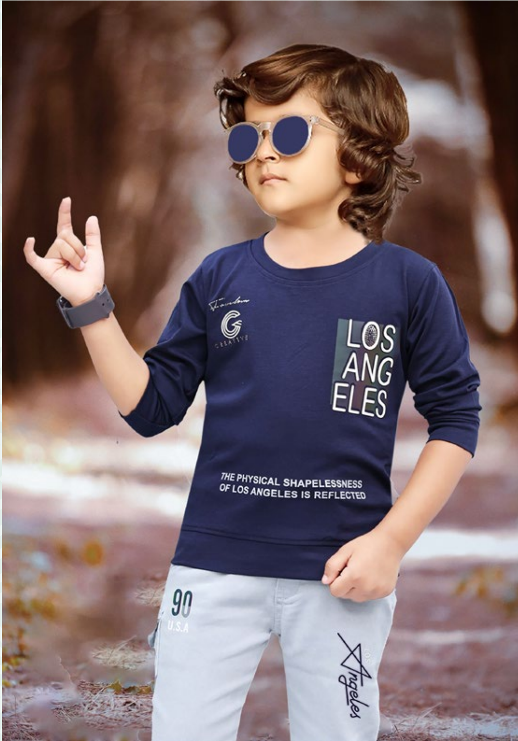
Karnika - a respected brand in the Indian garment industry with a legacy spanning over two decades.