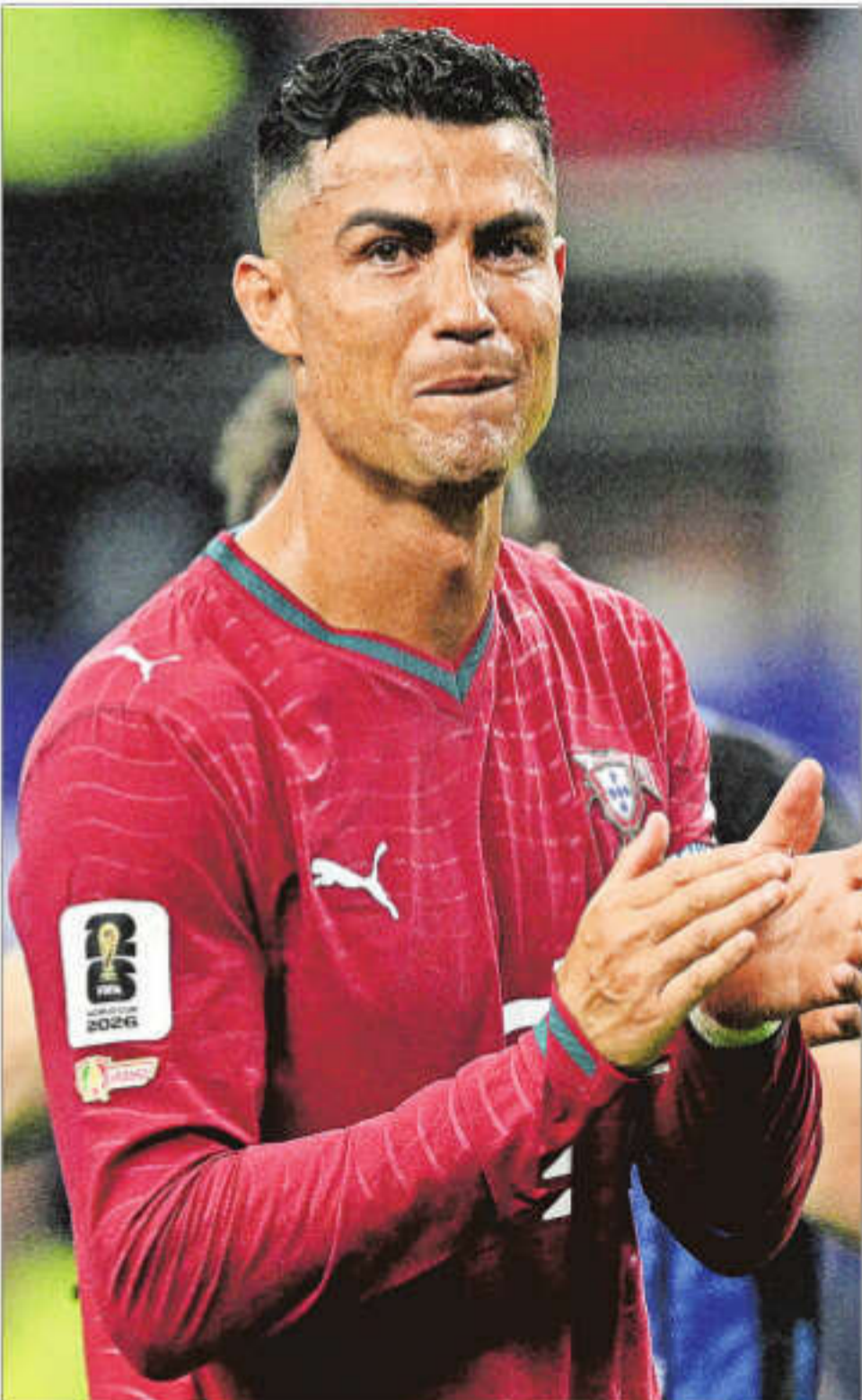
Cristiano Ronaldo looks dejected after Portugal lost the Round of 16 match against Spain

THE BIGGEST DREAM of Cristiano Ronaldo would remain unfulfilled forever. The man who guzzled most of the records and trophies that football could offer would slip into the sunset without its greatest prize, the World Cup.