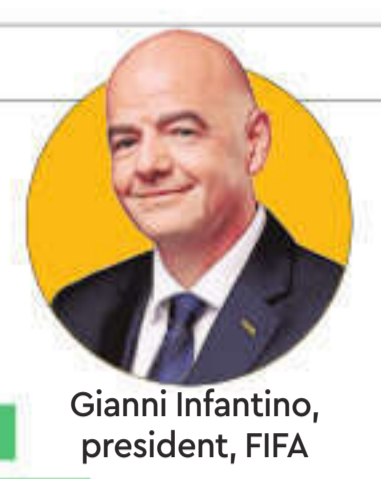
Gianni Infantino, president, FIFA

the controversy over US striker Folarin Balogun being allowed to play has begun to dissipate. Infantino, meanwhile, has remained resolutely focused in perhaps his most important job — generating cash.