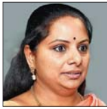
The move came a day after Kavitha said KCR's two nephews were involved in the Kaleshwaram scam

Hyderabad: The battle of cousins within former Telangana CM K Chandrababbarao's BRS claimed its biggest casualty Tuesday when a disciplinary committee suspended its daughter and MLC K Kavitha from the party for an unspecified period, citing her "recent attitude and anti-party activities". The implosion, which BJP attributed to a tussle among KCR's kin for the alleged spoils of the Kaleshwaram project scam, came a day after Kavitha publicly named her father's two influential nephews—former minister Harish Rao and ex-Rajya Sabha MP Jaganapala Samra Kumar—as being involved in the alleged misdeeds of corruption. But for the duo's alleged misdeeds, Justice