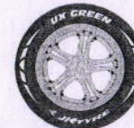
INDIA'S GREENEST TYRE MADE FROM 80% SUSTAINABLE MATERIAL

India, like other major economies, faces two significant challenges: the need to create a sustainable growth-oriented economy and the need to maintain competitiveness in the global market. At JK Tyre, we have demonstrated our strong commitment to ensuring Environment, Social, and Governance (ESG) considerations in our business practices, driving our non-financial performance.