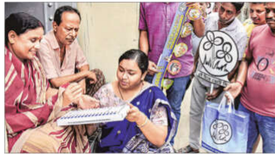
TMC workers conduct a drive using a dummy EVM machine to create voting awareness, in Mushidabad on Friday

"The fear the BJP has created through the SIR has convinced