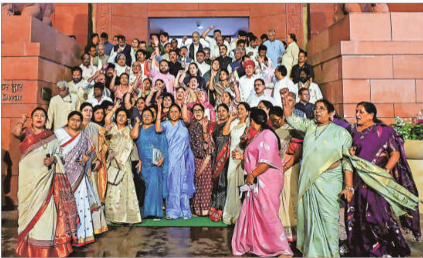
NDA MPs raise slogans during a protest after the Constitution Amendment Bill to implement delimitation and women's quota was defeated on Friday