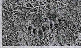
लकड़बग्घे के पैरों के निशान •